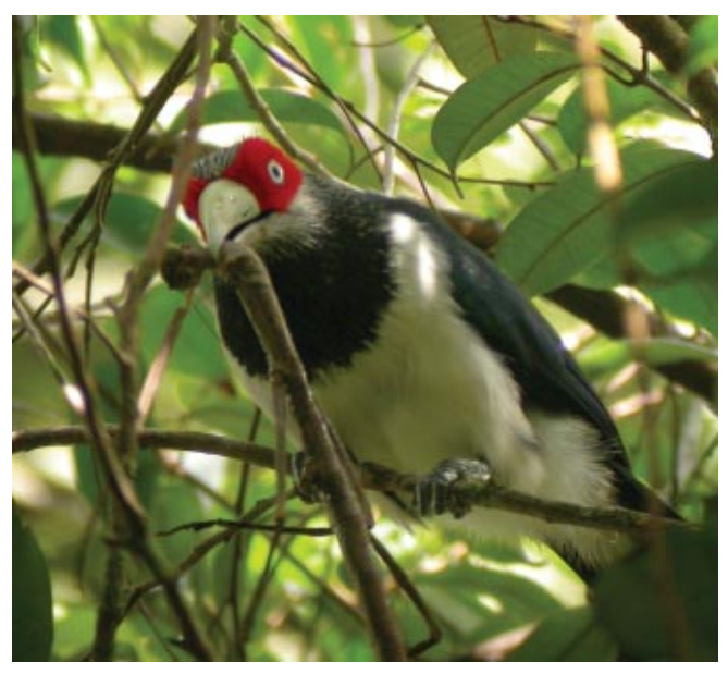
Plate 2. Red-faced Malkoha Phaenicophaeus pyrrhocephalus feeding on giant stick insect, December 2004, Sinharaja, Sri Lanka.