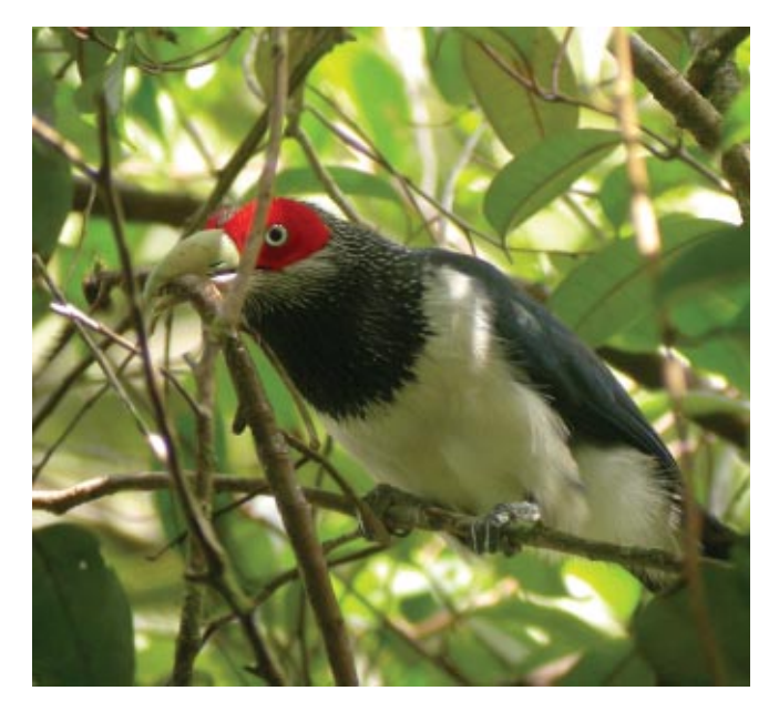
Plate 1. Red-faced Malkoha Phaenicophaeus pyrrhocephalus feeding on giant stick insect, December 2004, Sinharaja, Sri Lanka.

On 31 December 2004 at 10h25, while observing a mixedspecies bird flock in Sinharaja, I saw a Red-faced Malkoha fly into a dense thicket c.12 m above the ground, and c.12 m from me. The bird had white irides and was therefore identified as a female (males have brown irides: Legge 1880). At 10h30 it appeared on a more exposed branch holding in its beak a 25-cm long giant stick insect Palophus sp. (order Phasmatodea). I observed the bird through Leica Trinovid 10×42 binoculars, and I took a sequence of 53 photographs using a Kowa TSN 823 telescope and a Nikon coolpix 4500 digital camera over the next six minutes whilst the bird ate its prey. The bird shook the insect violently and on several occasions it appeared to nearly slip off its perch. At least the left rear limb was removed through this process (Plate 1). Stick insects are capable of autotomy (shedding limbs) in an emergency to divert the attention of an attacker (Meegaskumbura 1999). The bird then removed the thorax (Plate 2). Many species of stick insect deter predators by secreting a milky substance from special glands in their thorax. (Meegaskumbura 1999). The complete removal of the thoracic area may be to avoid this substance. The bird then shifted perches, removed the remaining limbs, and swallowed the remainder of the insect.