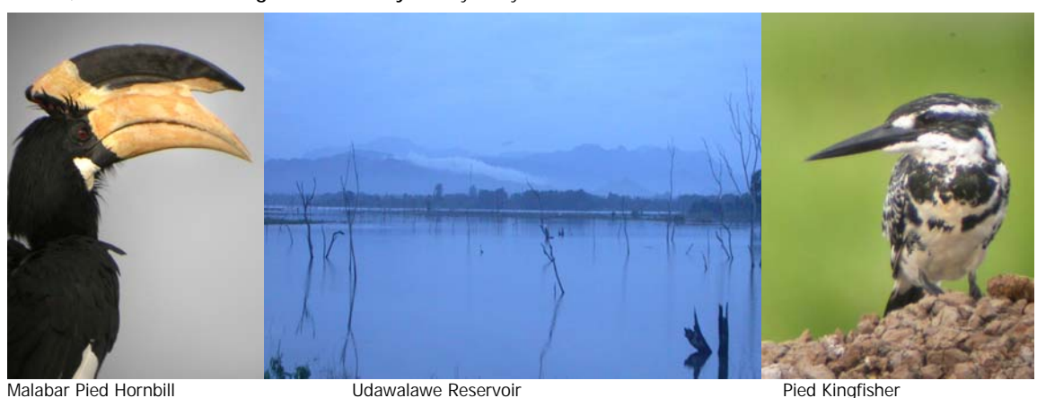
Highlights: Sri Lanka Frogmouth, Booted Eagle, Sri Lanka Spurfowl, Chestnut-winged Crested Cuckoo, Sri Lanka Scaly Thrush, White-faced Starling & Sri Lanka Myna. Day's tally: 37

Day 06 5 Feb An early vigil near Martin's for Sri Lanka Spurfowl for Peter produced first a female, followed by a male in the exact scanning zone that I specified to have the binocs pre-focused to give a climactic end to Sinharaja. A 3 ½ hour drive after breakfast saw us reaching the dry plains of Udawalawe and to our cosy overnight accommodation; Safari Village Hotel. The Udawalawe National Park was closed down two weeks ago due to some local considerations (It has been re-opened effective, 1 March, 2008) but that didn't matter to me as I had faith in my local patches to get the job done. For birders what matters at the end of the day is seeing their target birds not site-seeing, although I admit it would have been nice to have visited the park. With this positive thinking, we embarked on our first session in the dry lowlands after lunch.