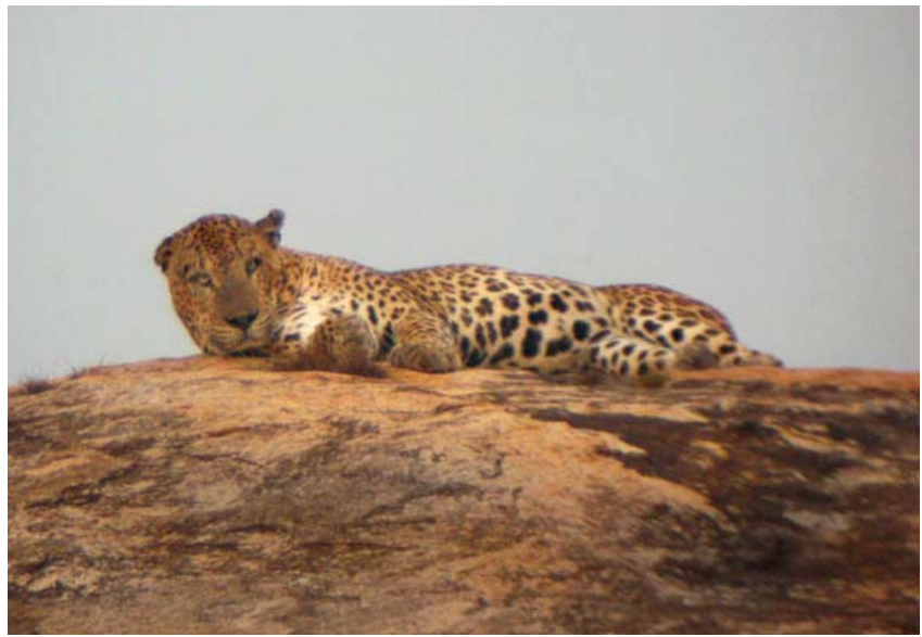
Our first Leopard at the Yala National Park, 7 Feb, 2007

Swamphen, Black-winged Stilt, Whiskered Tern, Black-tailed Gotwit, Little Stint, Lesser Sand Plover, Marsh Sandpiper & Painted Stork adding to our burgeoning list. A calling Indian Pygmy Woodpecker close by drew our attention as did a pair of the wanted Sri Lanka Woodshrikes, which were seen well. A cursory glance at another wetland after resuming our journey yielded Cotton Pygmy-goose, Eurasian Spoonbill, Gull-billed Tern, Ruff & Garganey.