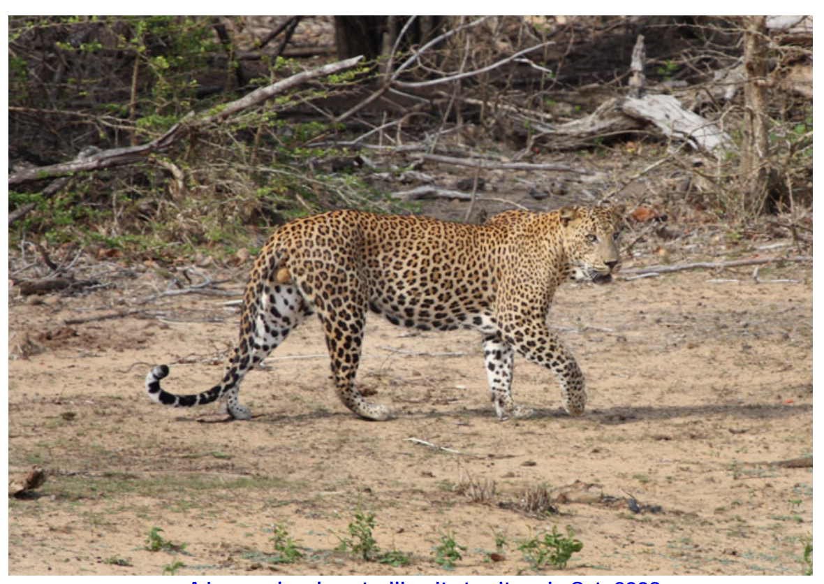
A Leopard male patrolling its territory in Oct, 2009.

Overnight: A transit hotel just 5 minutes from the airport.