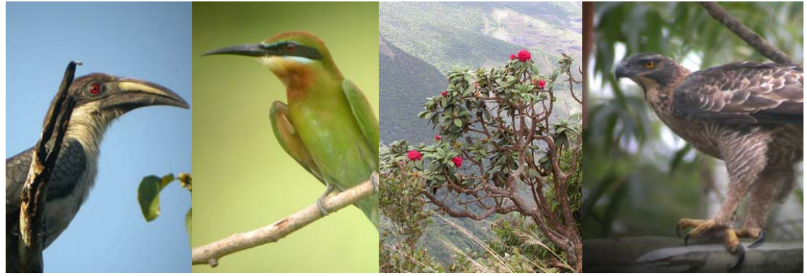
Sri Lanka Grey Hornbill Blue-tailed Bee-eater