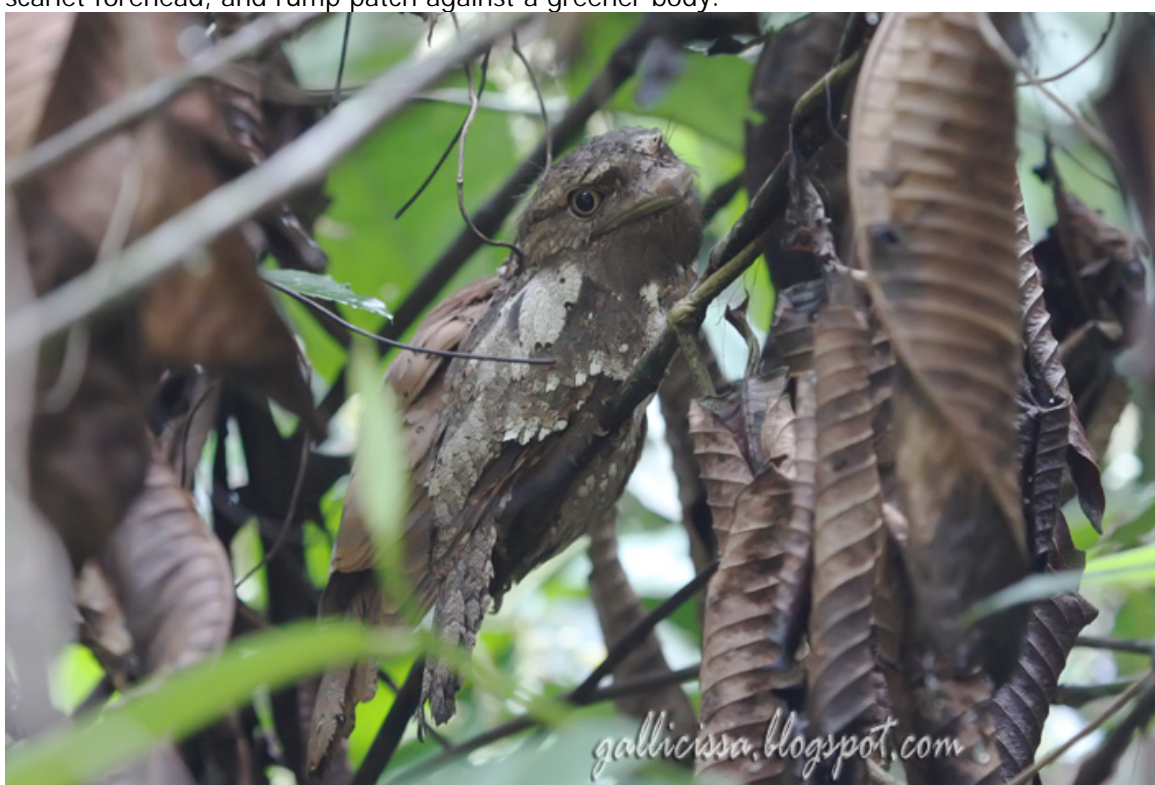
Sri Lanka Frogmouth at a daytime roost in a 14-day Absolute Birding tour in March, 2010. We bagged 12 out of the 15 resident night birds on this tour. This feat was equalled in April, 2010.

Our night bird tally is likely get ticking with the adorable Chestnut-backed Owlet at a stake out. The sonorous calls that fill the air may hold promise for yet another top bird—the Green-billed Coucal, which often proves tough at the more densely wooded Sinharaja.