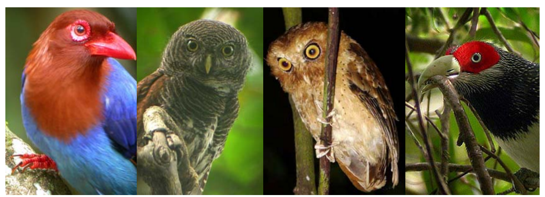
Sri Lanka Blue Magpie | Chestnut-backed Owlet | Serendib Scops Owl | Red-faced Malkoha