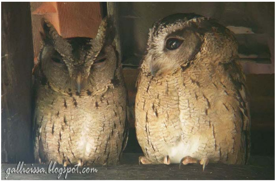
Indian Scops Owls in a daytime roost during my last "Birding in Style" tour

Consequently, these ecosystems harbour a rich diversity of wildlife, which makes Yala the premier National Park in Sri Lanka for birds and wildlife. In fact, Yala Block 1, comprising of 141 sq.km., has close to 40 Leopards identified individually by their unique facial spot patterns and other characteristics. This therefore, makes this area of Yala, a premier Leopard hotspot with probably the highest density of Leopards anywhere in the world.