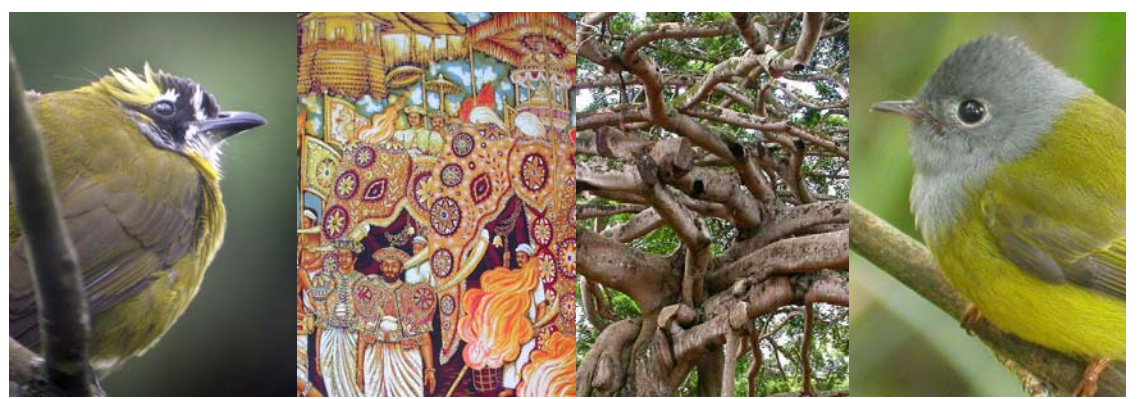
Yellow-eared Bulbul | Kandy Perahara pageant | | Giant Fig

As we ascend, vast stretches of tea gardens dominate the landscape—a cash crop introduced by the British, which is currently the country's third highest revenue earner. Drop in temperature (around 10-15 degrees centigrade) at Nuwara Eliya will necessitate sweaters, although some of you may welcome this change coming from the warmer lowlands. We will reach a patch closer to our accommodation in time to anticipate the arrival of the ultrasecretive montane endemic, Sri Lanka Whistling Thrush, which is one of the two "endangered" endemics.