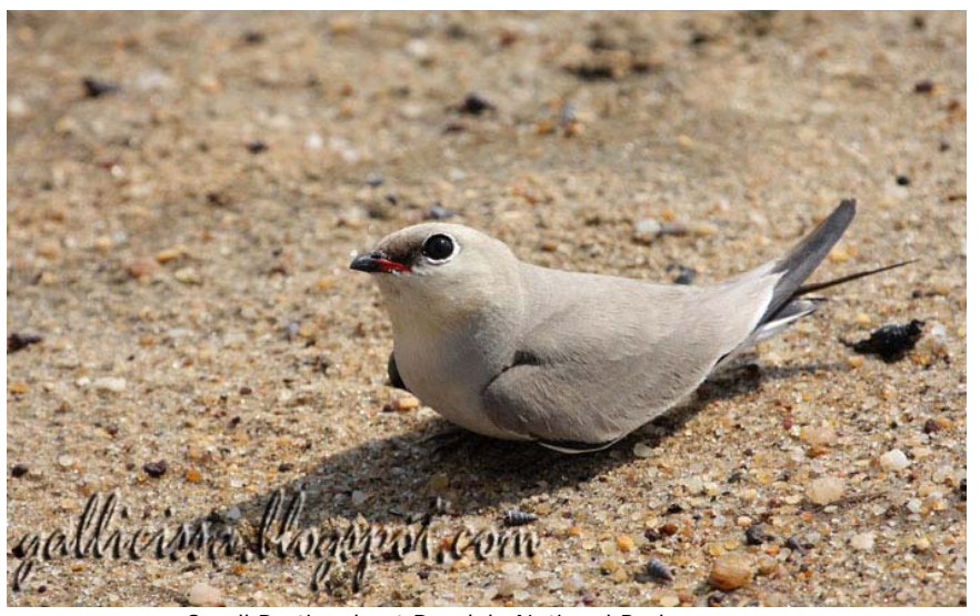
Small Pratincole at Bundala National Park.

Thereafter, I have another confirmed Absolute Birding tour from 9-24 April , 2011 (both private tours with exclusive arrangements).