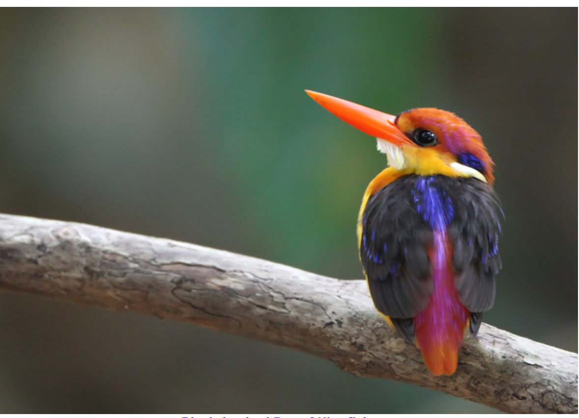
Black-backed Dwarf Kingfisher