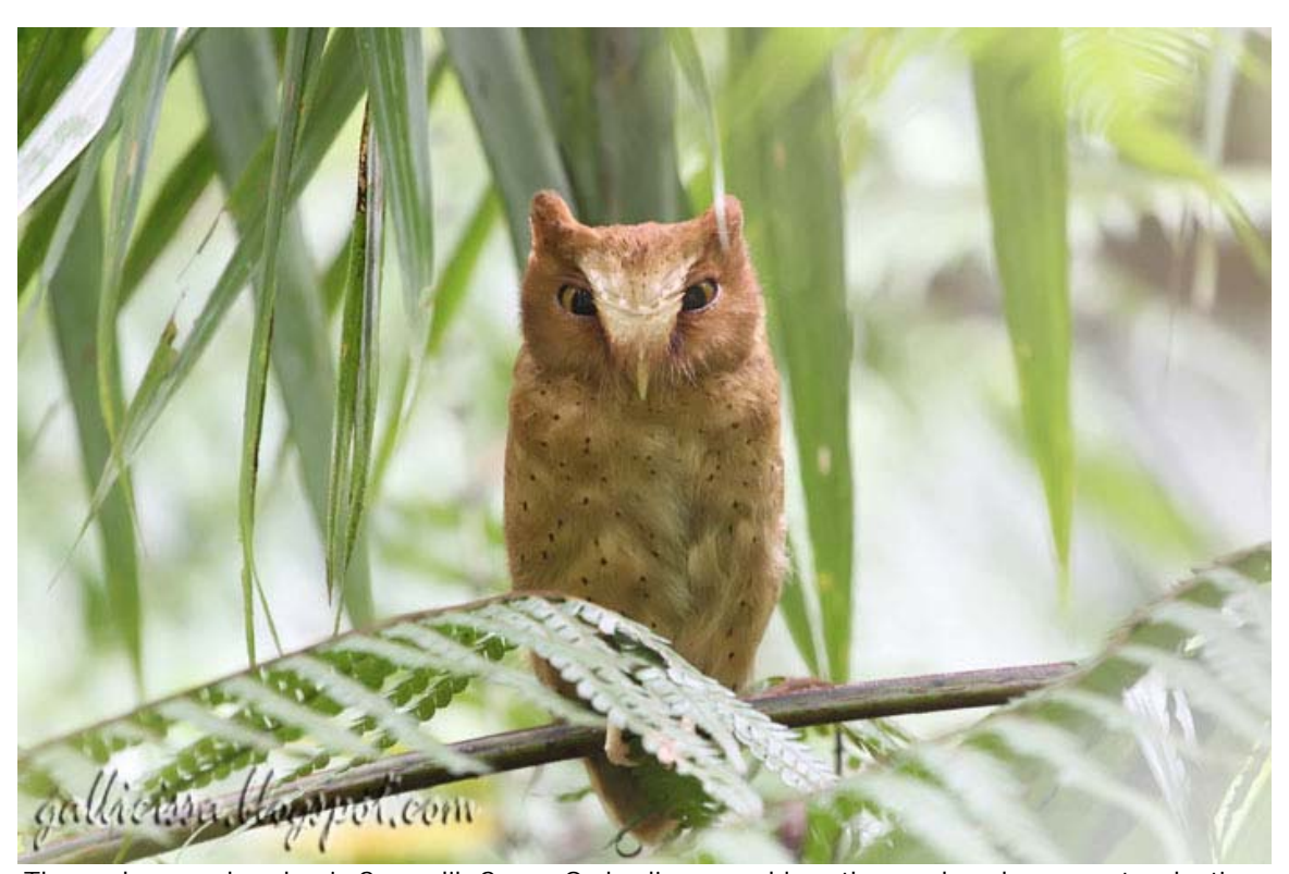
The endangered endemic Serendib Scops Owl—discovered less than a decade ago—at a daytime roost at Sinharaja in Sep., 2010.

White-faced Starling too keeps to the canopy. Ashy-headed Laughingthrushes, in comparison, are found in bottom levels of the flock, often scratching the forest's floor for insect prey. The Malabar Trogon hawks insects in the sub-canopy, and remains largely silent. The "steering wheel" of the flock, Orange-billed Babbler, which leads the flocks, occupies from the understorey to the canopy, and is closely watched by the sentinels of the flock, Sri Lanka Crested Drongo—which benefits from the "prey-beating effect" of the gregarious species such as babblers and Laughingthrushes as they forage. This drongo is capable of mimicking most members of the flock—a skill it uses to good effect to call in the birds to form flocks. And in real alarm situations, such as when there is a ground predator, it mixes its own alarm calls in given in such situations with copied versions of the ground-predator specific alarm calls of flock associates such as Orange-billed Babbler, and Ashyheaded Laughingthrush—as if to warn of the impending danger in their own language.