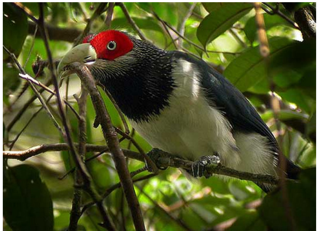
Red-faced Malkoha holding a giant stick insect Phobaeticus hypharpax (Westwood, 1859). in its beak, Sinharaja, in December, 2004.

The research following the halting of logging operations due to public outrage, led to the recognition of its amazing wealth of biodiversity, and in 1988, it was declared a World Heritage. The former logging tracks now provide the main access to the forest's interior for visitors.