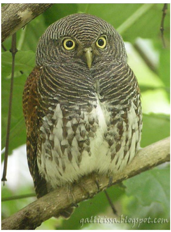
Chestnut-backed Owlet at Kithulgala

Birding: Black-capped Bulbul, Yellow-fronted Barbet, Sri Lanka Hanging Parrot, Layard's Parakeet, Sri Lanka Grey Hornbill, Sri Lanka Green Pigeon, Green-billed Coucal, Chestnut-backed Owlet, Crimson-backed Flameback, Sri Lanka Crested Drongo, Brown-capped Babbler, Sri Lanka Scimitar Babbler, Orange-billed Babbler, Serendib Scops Owl, Sri Lanka Frogmouth, Malabar Trogon, Brown-headed Barbet, Brown Hawk Owl, Black-backed Dwarf Kingfisher, Crested Serpent Eagle, Jerdon's Leafbird, Gold-fronted Leafbird, Dark-fronted Babbler, Orange Minivet, "Square-tailed" Black Bulbul, Lesser Hill Myna, Yellow-browed Bulbul, Indian Pitta, Forest Wagtail, Purple-rumped Sunbird, Long-billed Sunbird, Pale-billed Flowerpecker, Brown-breasted Flycatcher, Oriental White-eye, Lesser Yellownape, Rufous Woodpecker, Black-rumped Flameback, "Southern" Coucal, Asian Palm, House Swifts, Indian Swiftlet, Crested Treeswift, Asian Paradise Flycatcher, Tickell's Blue Flycatcher, Green Imperial Pigeon, Black Eagle, Rufous-bellied Hawk Eagle. (In an 18-day birds, wildlife and culture tour done with 2 British birders (24 Jan-9 Feb, 2009), we managed to score 19 of the 33 endemics at Kithulgala on the first 2-days. This tally was equalled in April, 2010 with a single U.S. birder.)