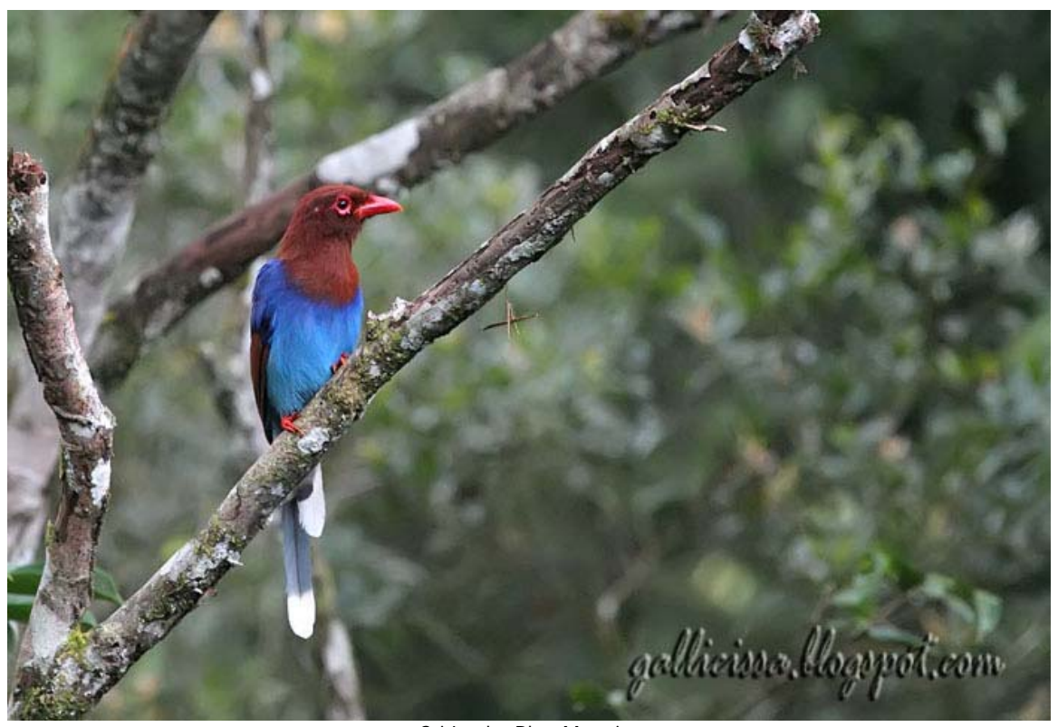
Sri Lanka Blue Magpie.

Non-birding highlights: Dragonflies: Asian Skimmer, Marsh Skimmer, Sapphire Flutterer, Wall's Grappletail, Dark-glittering Threadtail, and Jungle Threadtail; Butterflies: Giant King Crow, Tawny Rajah, Red-spot Duke, Five-bar Swordtail (seasonal), Great Eggfly, Rustic, Three-spot Grass Yellow, One-spot Grass Yellow (seasonal), Tailed Jay, Blue Glassy Tiger, and Sri Lanka Tree Nymph; Botany: Ant plant, 45m canopy giants of various Dipterocarp species, and the alien Bamboo orchid; Mammals: "Western" Purple-faced Leaf Monkey, Red Slender Loris (if lucky), Giant Squirrel, Layard's Squirrel, and Dusky-striped Squirrel.