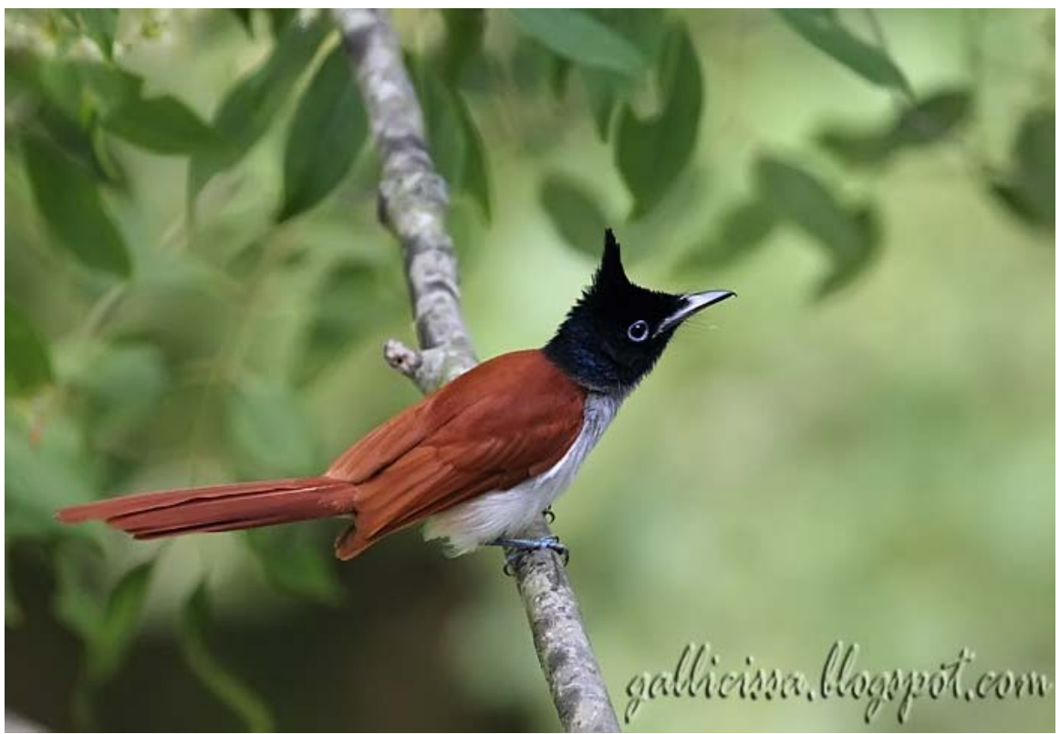
Asian Paradise Flycatcher

In addition to the above, we will try to obtain improved views of the endemics already seen and try to experience the magic of mixed species bird flocks.