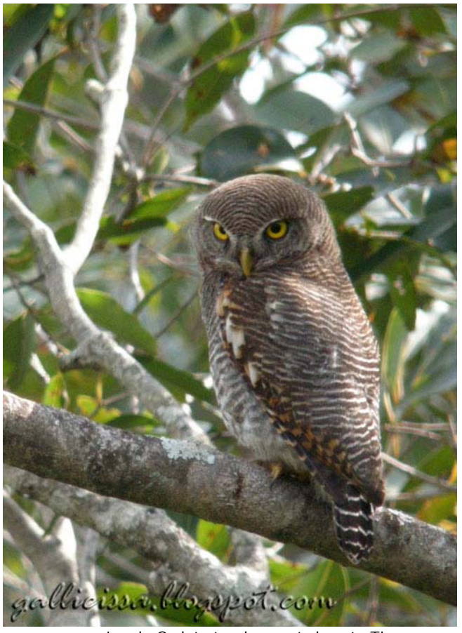
Jungle Owlet at a dayroost close to Tissa

Blue, Blue Mormon, and Common Lascar; Reptiles: Common & Green Forest Lizards, Land Monitor, Water Monitor, and Mugger Crocodile.