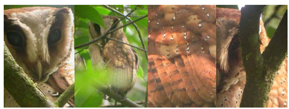
Sri Lanka Bay Owl, in a day roost discovered in Jan 2007