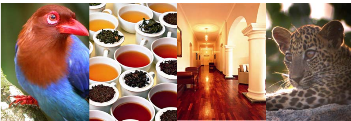
Sri Lanka Blue Magpie