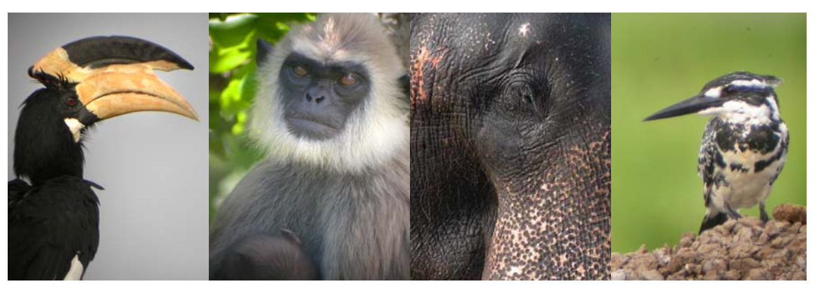
Malabar Pied Hornbill