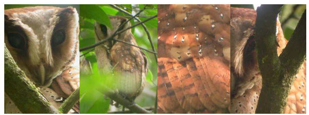
'Sri Lanka' Bay Owl, in a day roost discovered in Jan 2007

For rates and details e-mail <u>info@birdwingnature.com</u> or phone 0094-777-591155 Website: <u>www.birdwingnature.com</u> Amila's Birding & Wildlife Blog: <u>Gallicissa...a birder in an endemic hotspot</u>