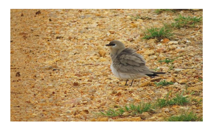
Day 7 – Excellent morning safari at Bundala National Park finally seeing Small Pratincole and Pintailed Snipe , two of my Asian bogey birds. Plenty of other birds excite and we spend time grilling Paddyfield and Blyth's Pipits , and I

represented with Lesser , Grey-bellied and Jacobin . Drive to Tissaramahama via a patch of woodland, searching unsuccessfully for Oriental Dwarf Kingfisher. Birding around the Tissa wetlands in the afternoon enjoying what is now a rare natural history spectacle anywhere in Asia with thousands of wader birds and trees surrounding the lake dripping with Indian Flying Foxes. Five Watercock represented only my second sighting anywhere, but even better was a pair of displaying Greater Painted-snipe , the female bobbing and wing flapping in front of the male. A chance encounter with a Jungle Cat completed a fantastic day, just a whisker short of 100 species of birds.