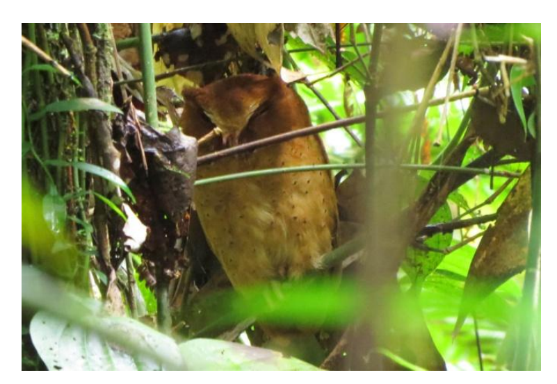
Day 4 – Pre-dawn owling finally delivers a nightbird the hard way, a Brown Fish-owl en

Day 3 – Our final morning at Kitulgala and this time Amila strikes gold locating a roosting Serendib Scops Owl , a species only first seen as recently as 2001 and described to science three years' later. Outrageous views of a male Sri Lanka Spurfowl on the walk back to complete a memorable morning. Drive to Sinharaja for another unproductive night bird session, somewhat ominously with little vocalising.